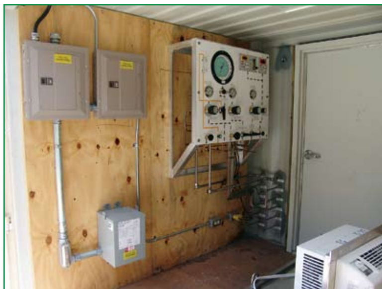
Fly Away Pack Building