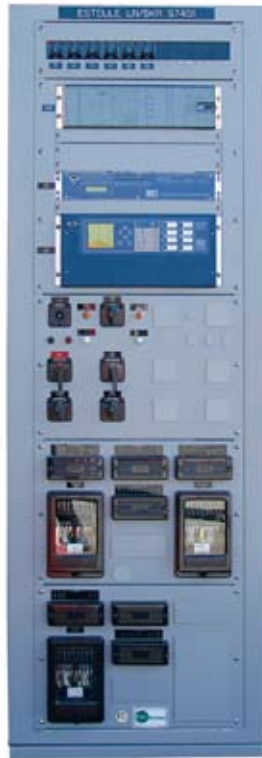
Line Breaker Panel