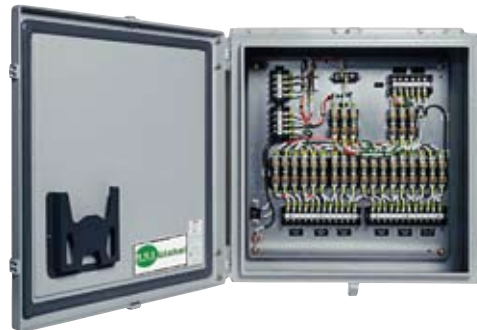
Substation Junction Boxes