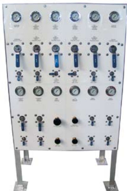
Gas Management Panel