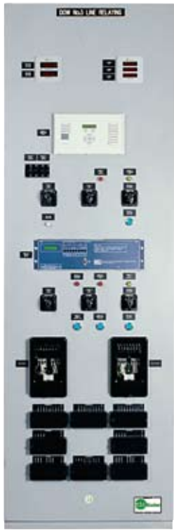
Line Breaker Panel